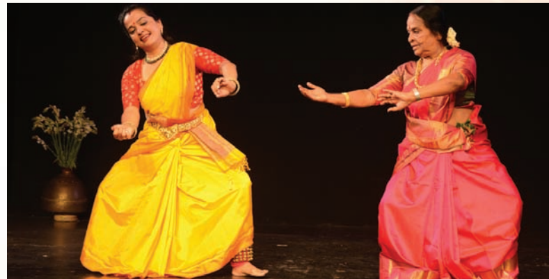
Workshop - Seminar in New Delhi Conducted by Kerala Sangeet Natak Akademi

Organised many workshops, seminars, webinars and talk shows.