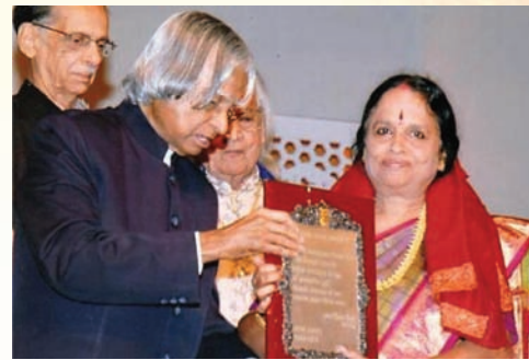
Kendra Sangeeth Natak Akademi Award from Honorable President Dr. A.P.J. Abdul Kalam (2006)