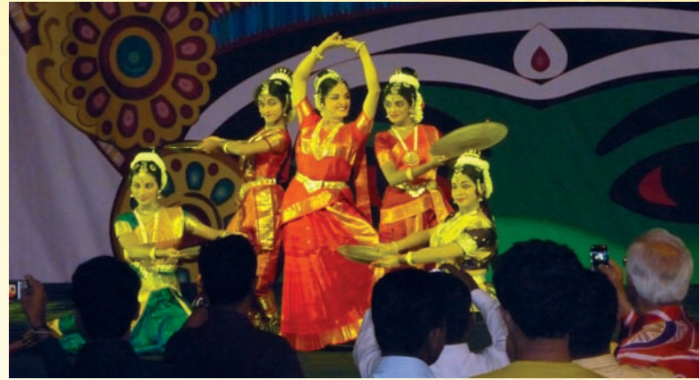
Performance In the presence of then PM Dato Najib Tun Razak of Malaysia