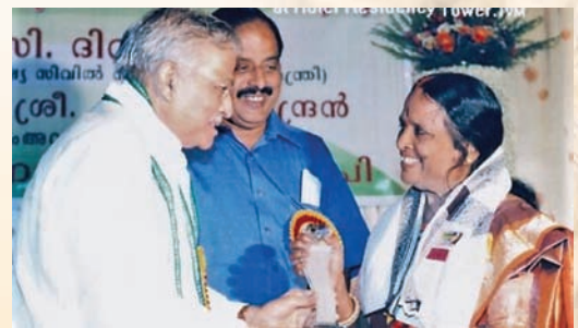
Venad Cultural Award from Central Minister Sri. Murali Manohar Joshi (2008)