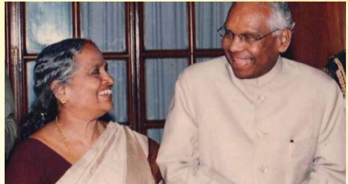
With Honorable President Dr. K.R. Narayanan at Rashtrapathi Bhavan (2000)